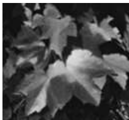
The Boys Bugle